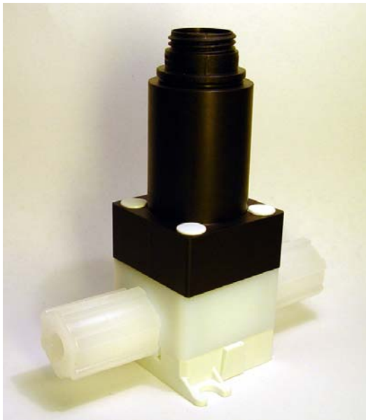
The CS-928™ Optical Fluidic Cell measures 85mm x 50mm x 95mm

CS-928™ is Jetalon's compact, real-time, metal ion concentration sensor for liquid chemicals. The CS-928™ sensor head has a miniaturized surface plasmon resonance optical subsystem and the active sensor surface is customizable to measure the concentration of a variety of metal ions including Cu, Ni, Co, Pb and Hg. CS-928™ can measure concentrations from 50 ppb to 20 ppm (and greater) with a response time of less than 10 seconds. The compact size and digital electronics circuit make CS-928™ convenient to install and scalable for up to four simultaneous metal ion concentration measurements. CS-928™ can be used as a concentration monitor with configurable alarms and as a process control system. Concentration measurements are output to a LCD screen and to customizable analog and digital data outputs. Jetalon's 928-connect™ graphical user interface software provides additional functionality for data acquisition, analysis and field calibration.